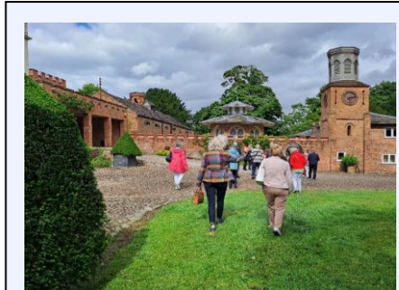
July visit to Combermere Abbey

We are looking forwards to our Autumn/Winter season of talks and activities and to meeting everyone again in a spirit of friendship.